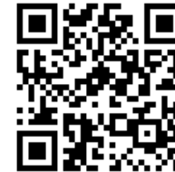
1FeexV6bAHb8ybZjqQMjJrcCrHGW9sb6uF balance chart

79,957.16 424212 BTC Balance: 515,154,357.72 USD Received: 79,957.16 42 BTC (111 ins) first: 2011-03-01 11:26:19 last: 2017-10-25 16:04:14 Sent: 0 BTC (0 outs) first: last: Unspent outputs: 111